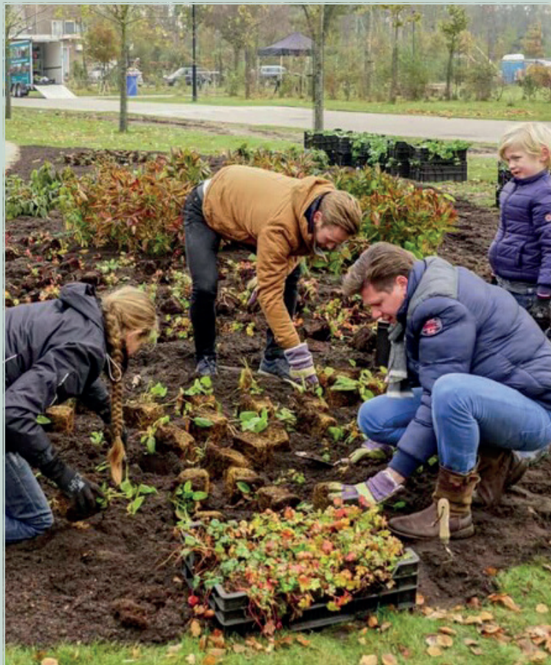
Residents assist in the construction of the Blue Carpet

The Main Building Front (Pavilion Sturmia) should be ready mid-May, when buyers can start finishing their homes. That will also be when the buildings on Pauluslaan, between the access gate and Bernadette, will be finished. More plants will be planted later this season. Tree felling has commenced on site, revealing the contours of the plots. Trees are also being taken down on plots where buyers are to start building their homes. If you have any questions, or comments, please let the service manager know.